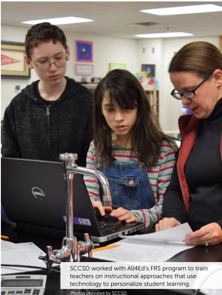
SCCSD worked with All4Ed's FRS program to train teachers on instructional approaches that use technology to personalize student learning.