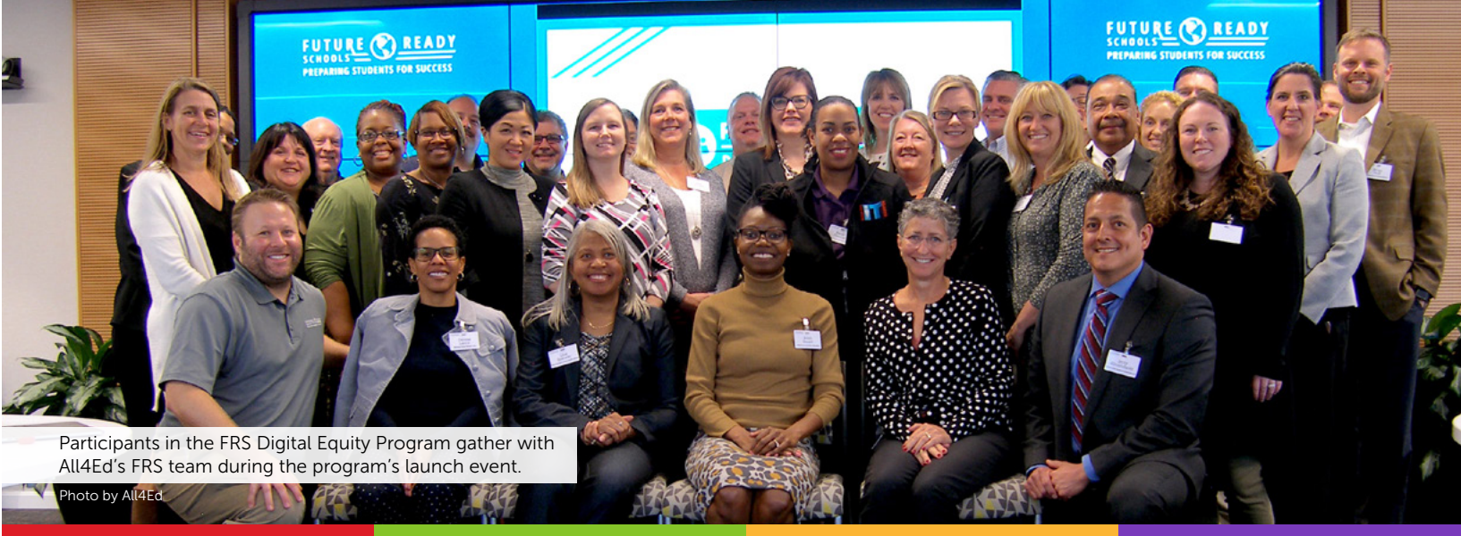
Participants in the FRS Digital Equity Program gather with All4Ed's FRS team during the program's launch event.