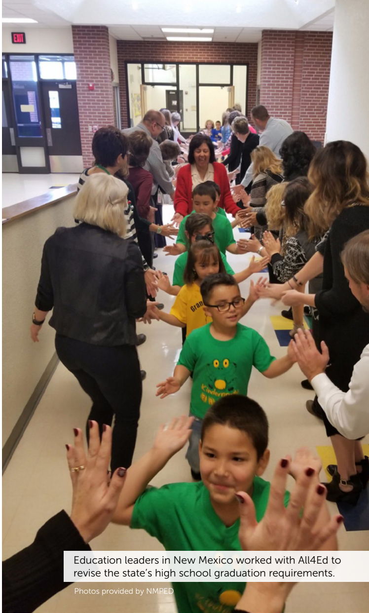
Education leaders in New Mexico worked with All4Ed to revise the state’s high school graduation requirements.