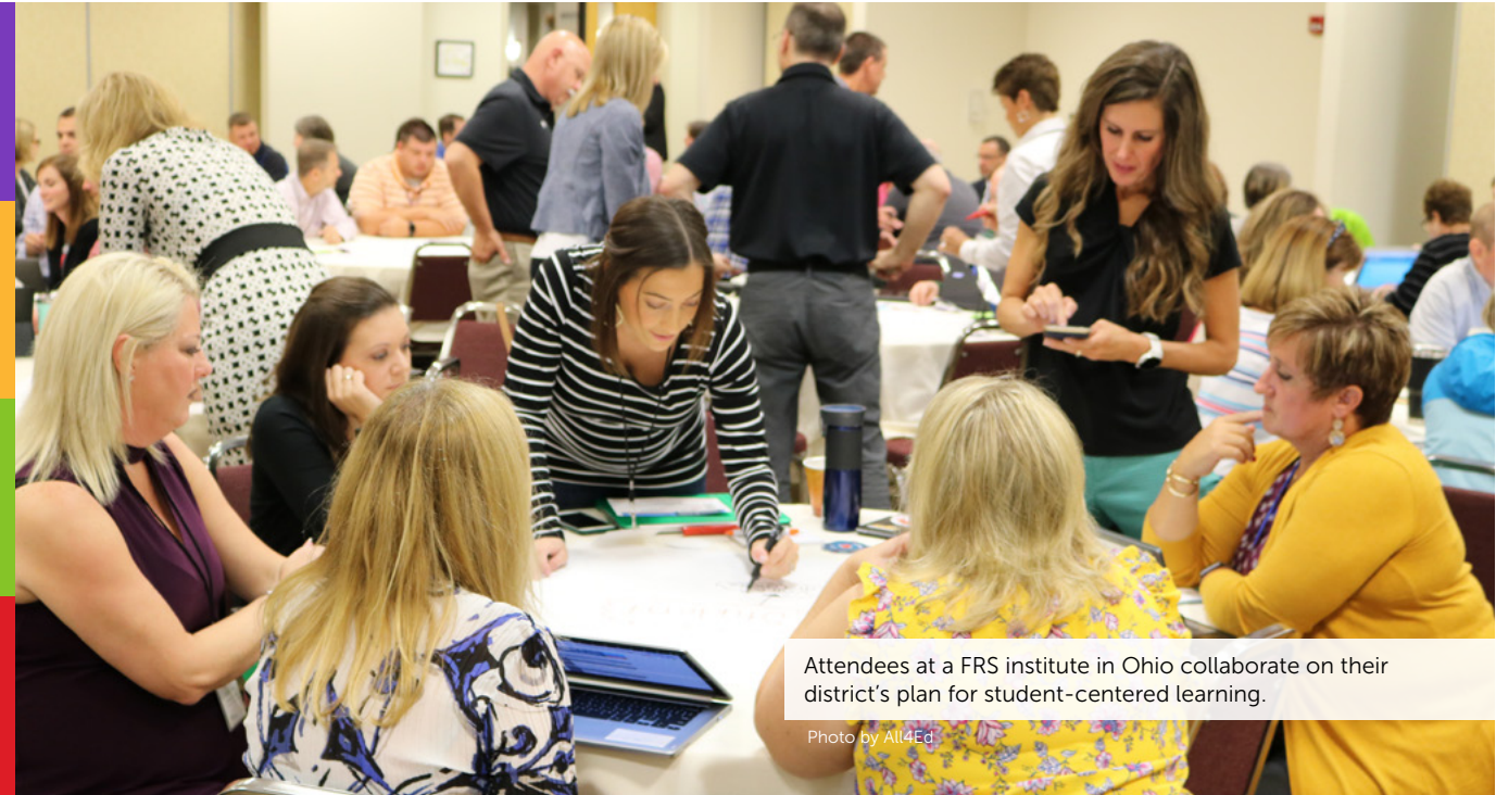
Attendees at a FRS institute in Ohio collaborate on their district's plan for student-centered learning.

Future Ready Schools® Our Future Ready Schools® (FRS) network helps district and school leaders leverage their technology investments to improve learning outcomes for students. FRS offers evidence-based strategies to increase innovation and student-centered learning practices in schools. Education professionals from more than 3,300 school districts—representing nearly 19.1 million students—participate in our FRS network, which offers district and school leaders ongoing professional learning opportunities to realize the potential of their technology purchases with research-based innovative teaching and learning strategies. In 2018, FRS continued to grow and engage district leaders, principals,