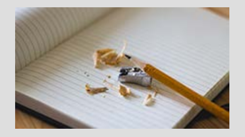
Editorial: Student gains a strong reason to keep PARCC