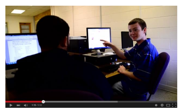
Talladega: Project-Based Learning Ignited by Technology

A new Alliance for Excellent Education digital case study demonstrates how one predominantly low-income school district dramatically improved student engagement in the classroom and increased high school graduation rates through project-based learning (PBL) and the effective use of technology. The case study, which includes short video segments with educators and students, focuses on Talladega County Schools in Alabama, where technology is an important component that builds students' abilities to solve real-world problems; master college- and career-ready academic